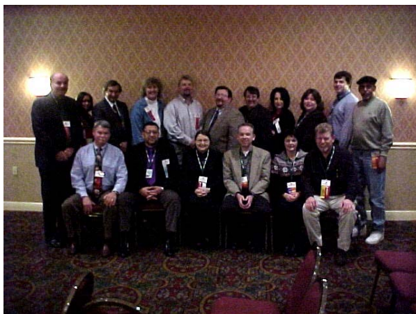
The 2003-04 LEHA Board